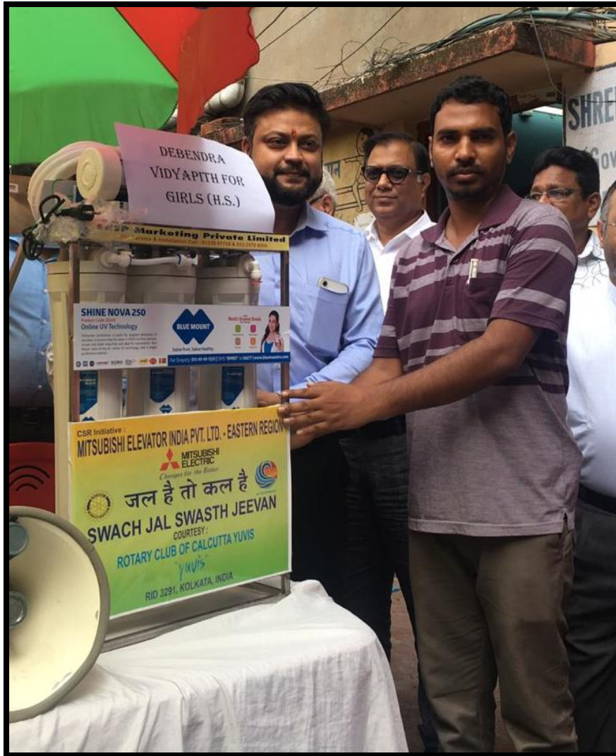
“Shree Sarada Vidyalaya”