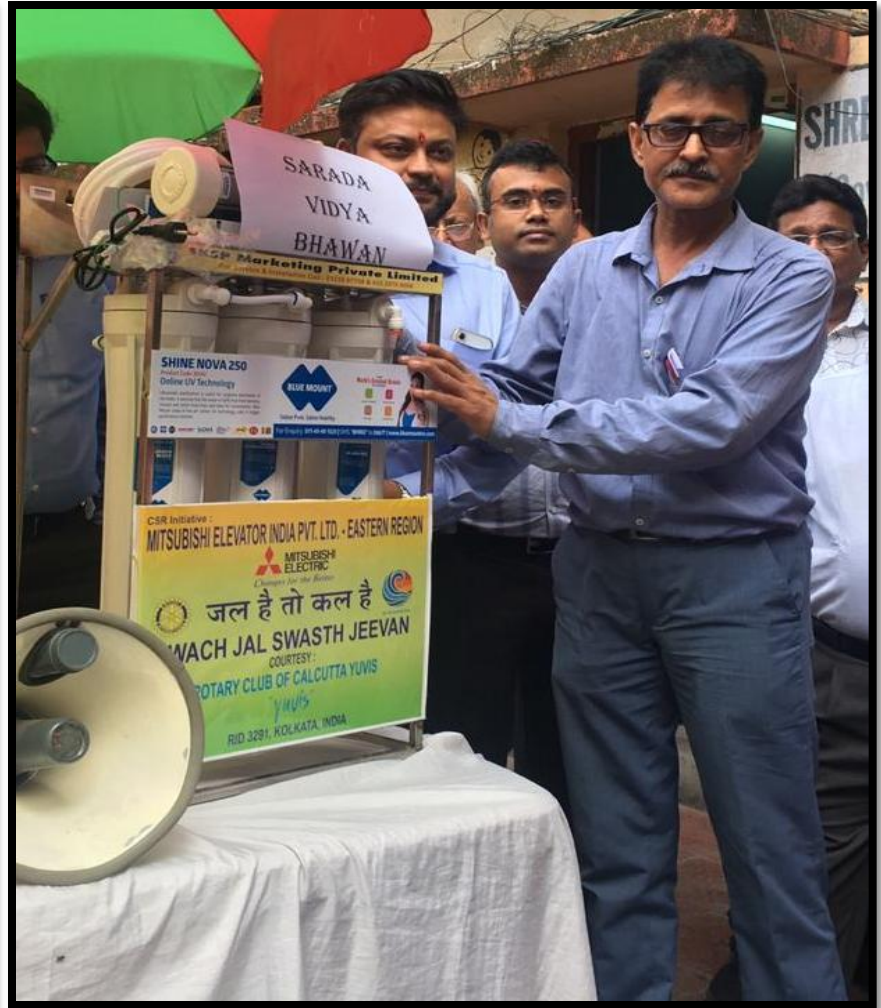
“Sarada Vidya Bhawan”