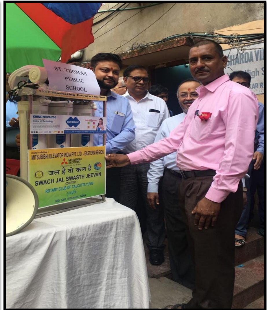
“St. Thomas Public School”