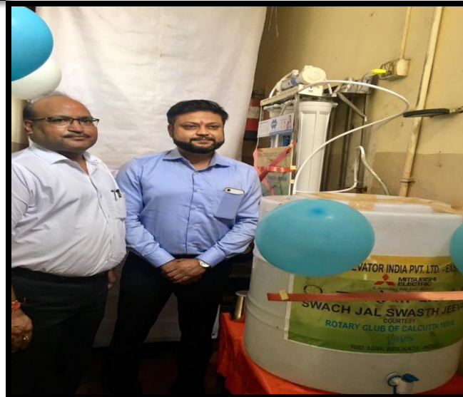
Inauguration of the Water Purifier for students of Entally Academy