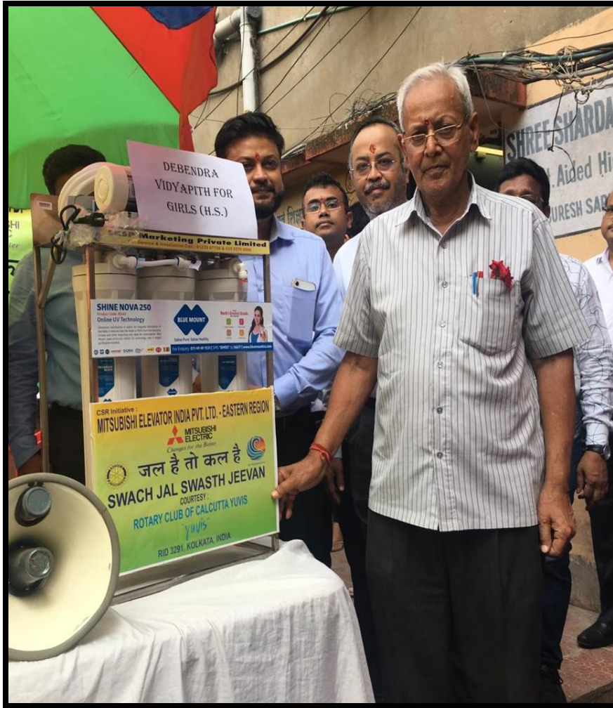
“Debendra Vidyapith for Girls”